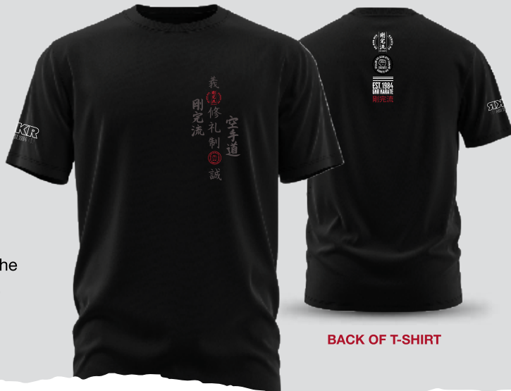
BACK OF T-SHIRT

Available in Kids & Adults Sizes. Features graphics on the front, back and sleeve.